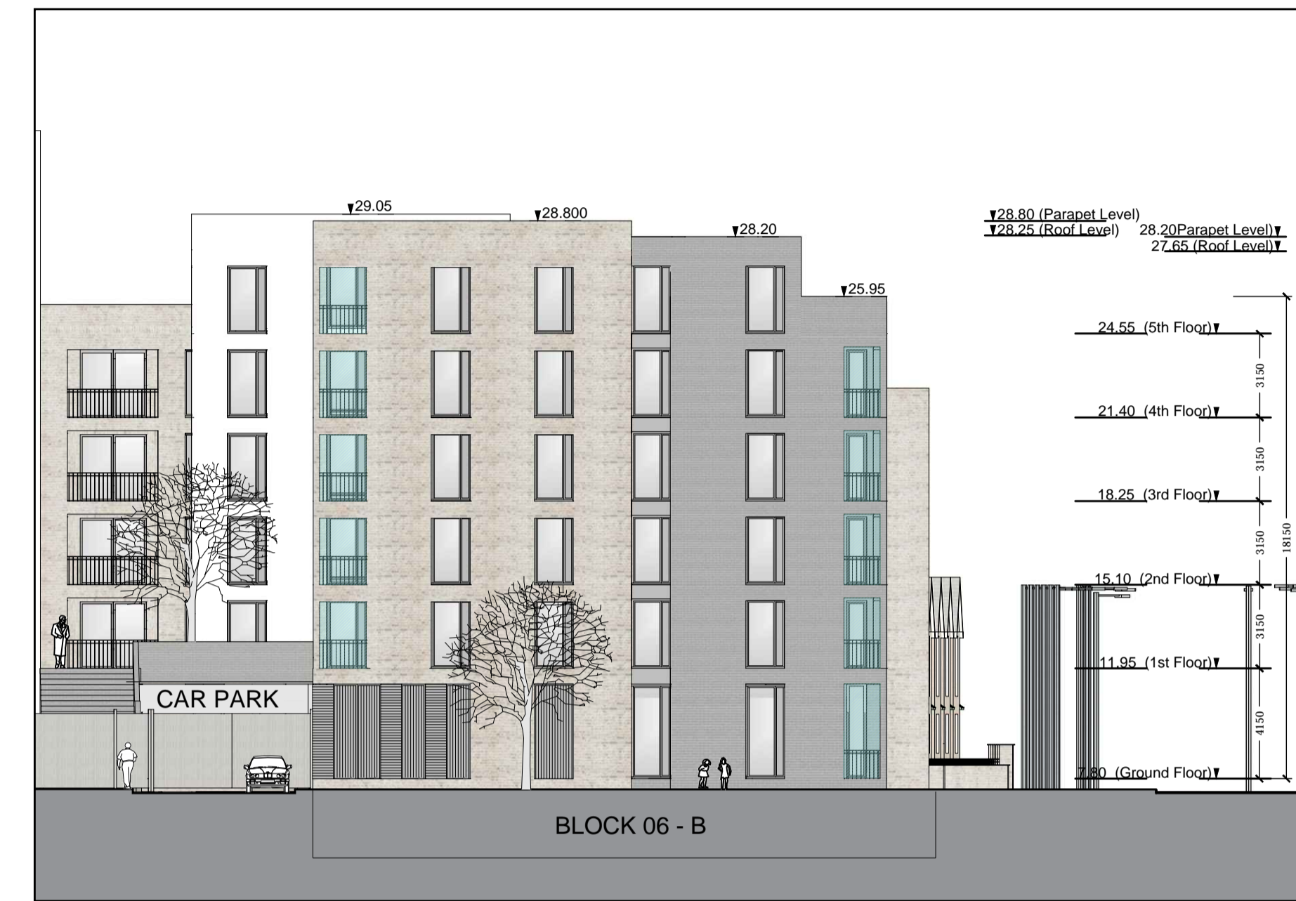
B06 - B - EAST ELEVATION Scale 1:200