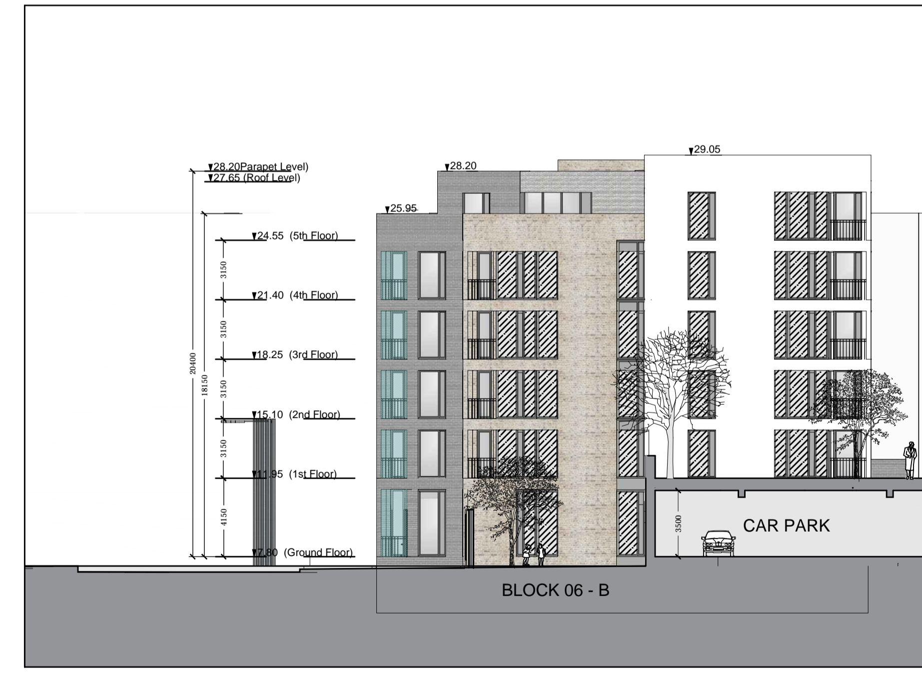
B06 - B - WEST ELEVATION Scale 1:200