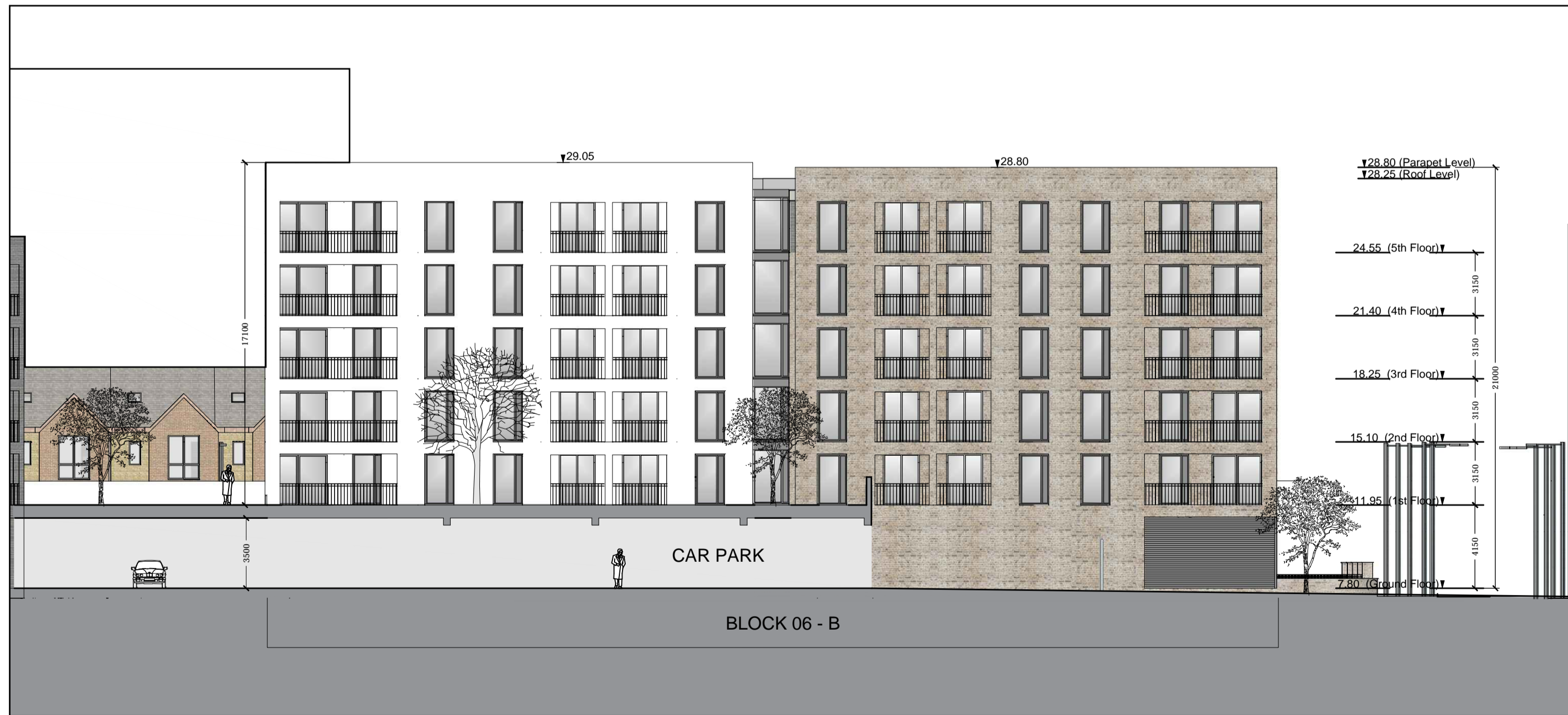
B06 - B - SOUTH ELEVATION Scale 1:200