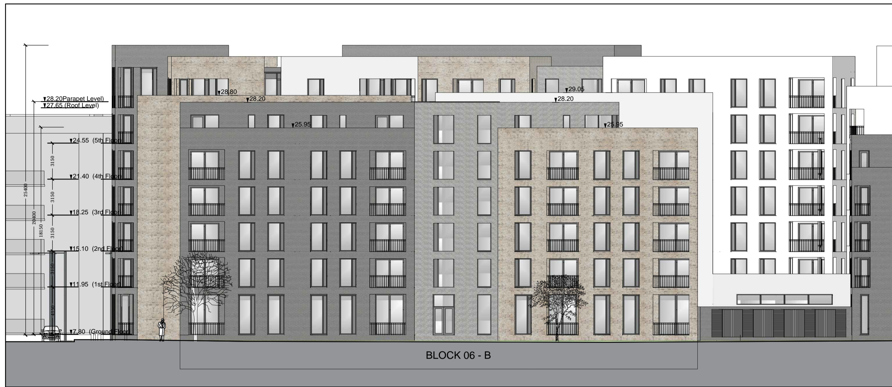
B06 - B - NORTH ELEVATION Scale 1:200